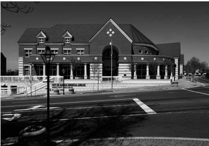
FAIRFAX LIBRARY; FAIRFAX, VIRGINIA