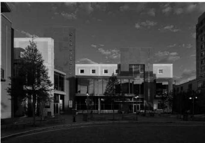
SHIRLINGTON LIBRARY; ARLINGTON, VIRGINIA