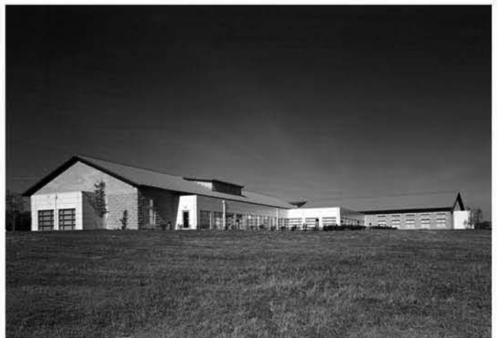
BOWMAN LIBRARY; WINCHESTER, VIRGINIA