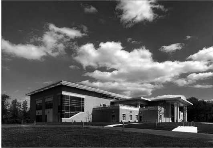
WEST COUNTY LIBRARY ODENTON, MARYLAND