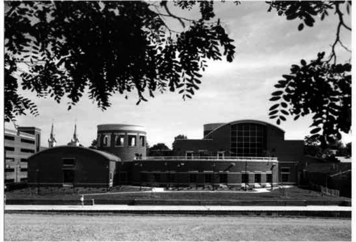
C BURR ARTZ LIBRARY FREDERICK, MARYLAND