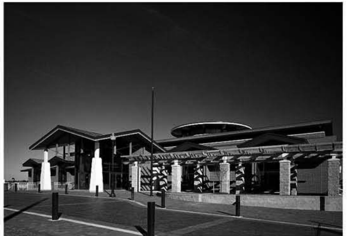
GERMANTOWN LIBRARY; GERMANTOWN, MARYLAND