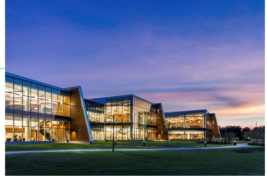
The TCC/VBPL Joint-Use Library