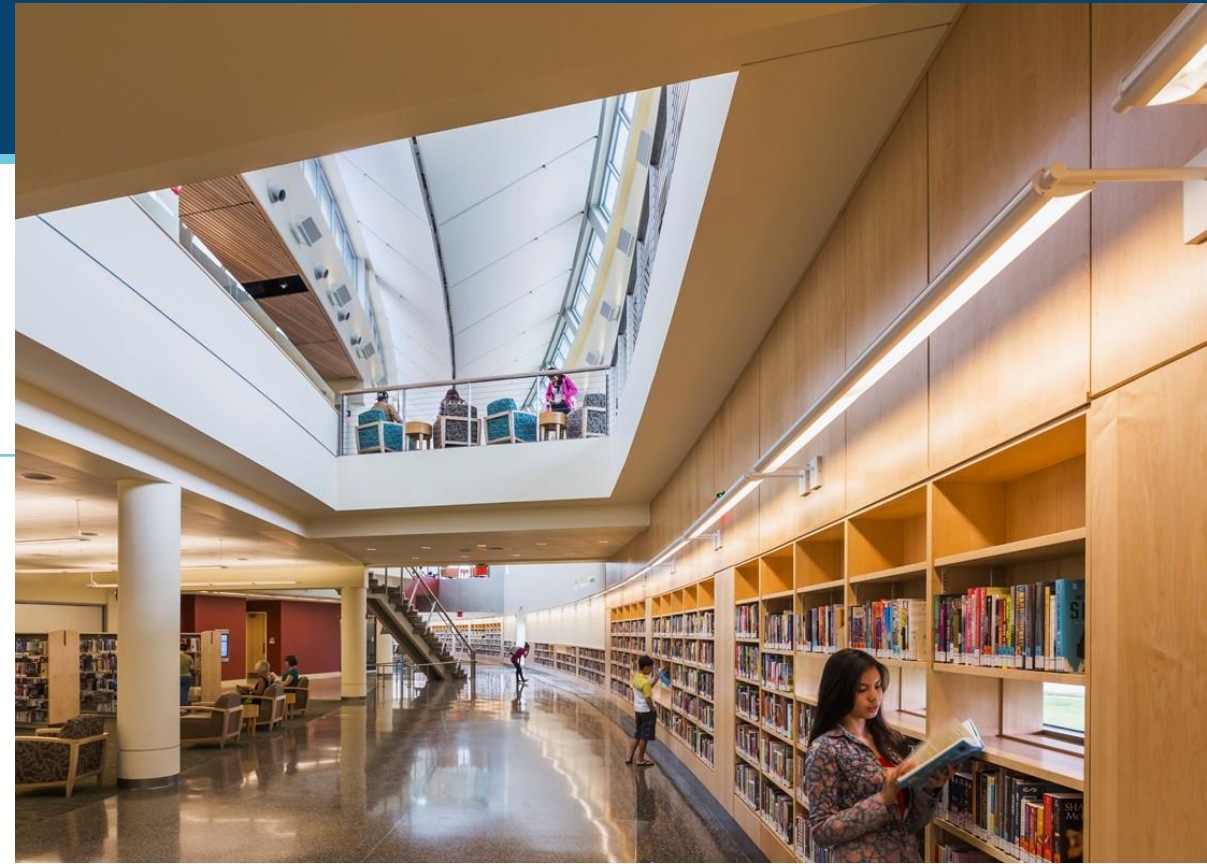
The TCC/VBPL Joint-Use Library interior “Main Street”